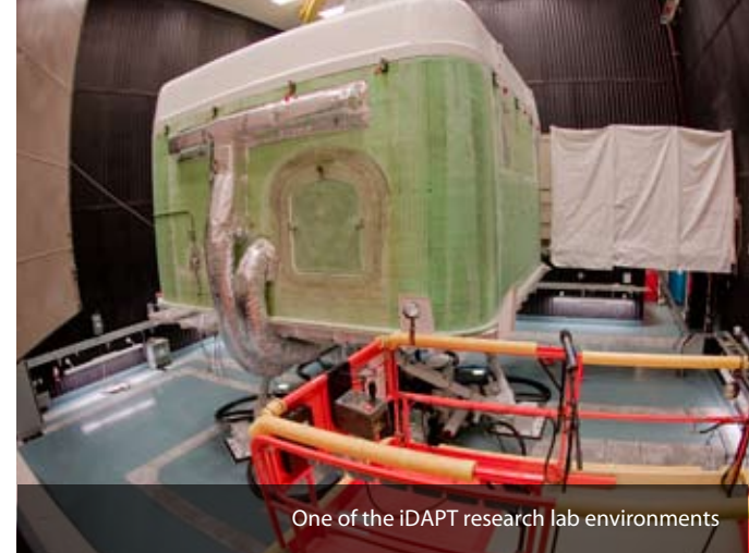
One of the iDAPT research lab environments

The iDAPT facilities have been significantly funded by the generosity of the community and corporations who supported the Toronto Rehab Foundation's Everything Humanly Possible campaign.