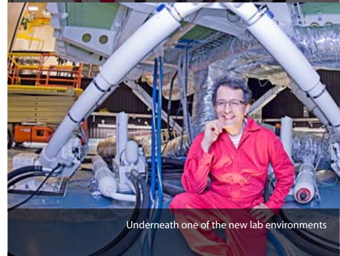
Underneath one of the new lab environments